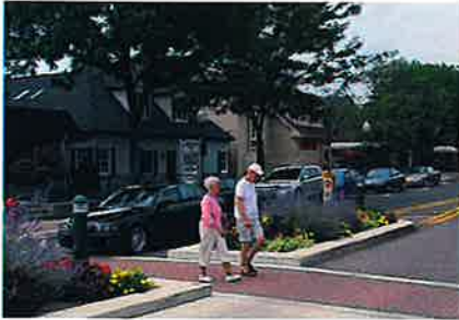
Go for a walk