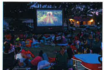
Participate in activities