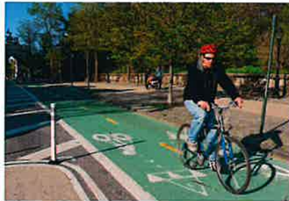
Ride a bike