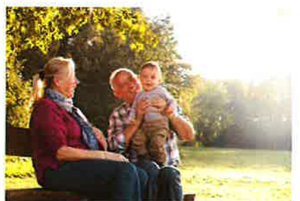
... and make their city, town or neighborhood a lifelong home.