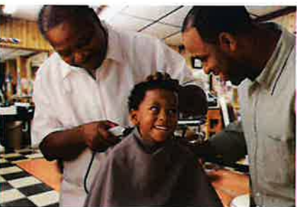
Find needed services