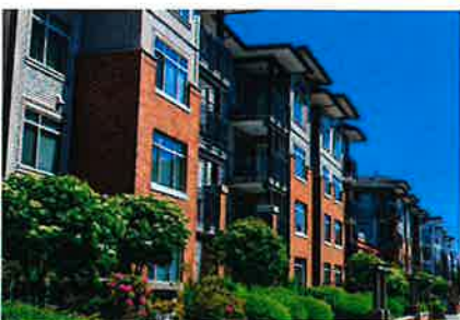
Live safely and comfortably