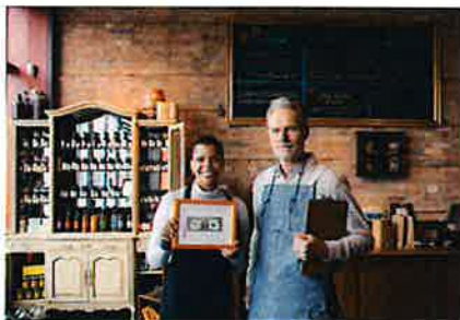
Work or volunteer