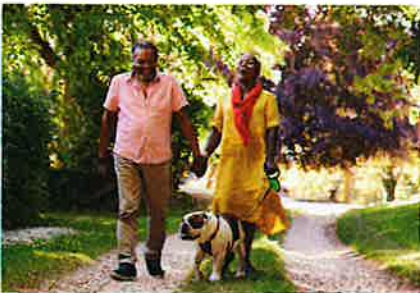
Spend time outdoors