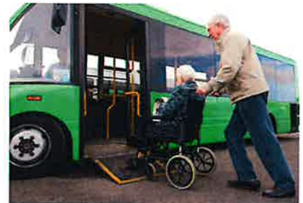
Get around without a car