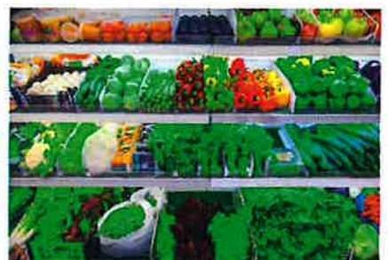
Buy healthy food