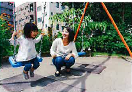
Enjoy public places