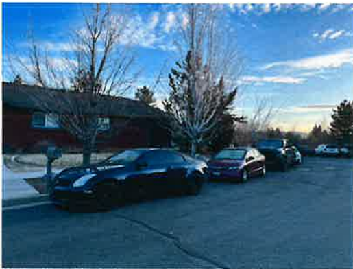
March 31, 2023