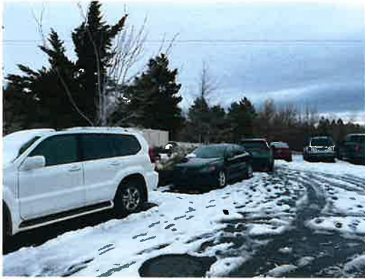
February 25 2023