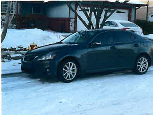
February 2, 2023