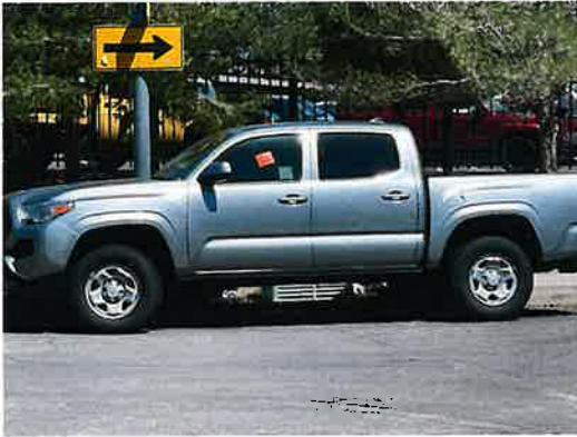
May 13, 2023