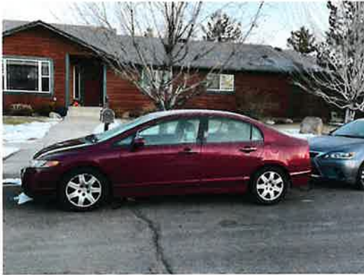
February 2, 2023