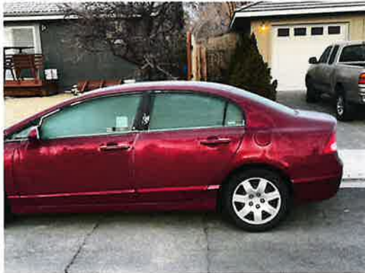
February 8, 2023