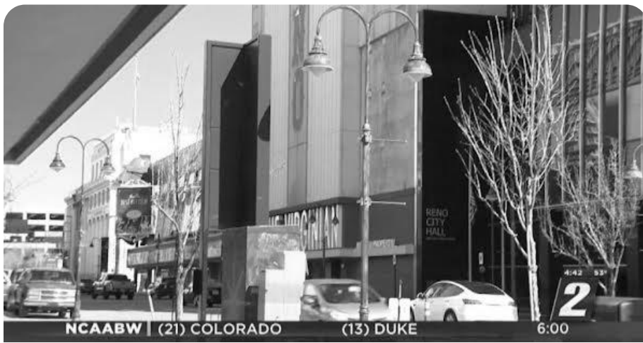
Businesses Bet on Downtown Reno 2news.com

I keep up with the Reno council meetings on YouTube, and I also watch Ward 5 meetings as well. I have known both of these individuals for a while, and I thought a few things should be brought to your attention. Both of these individuals were fired from the previous establishment they worked at, Peppermint Hippo, for foul behavior with patrons and fellow employees. I have spoken directly with the general manager, and he has warned the nightlife community of their intentions.