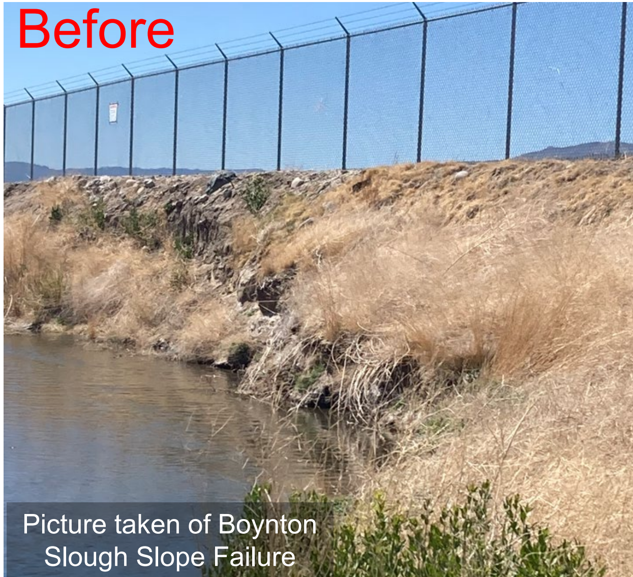
Picture taken of Boynton Slough Slope Failure