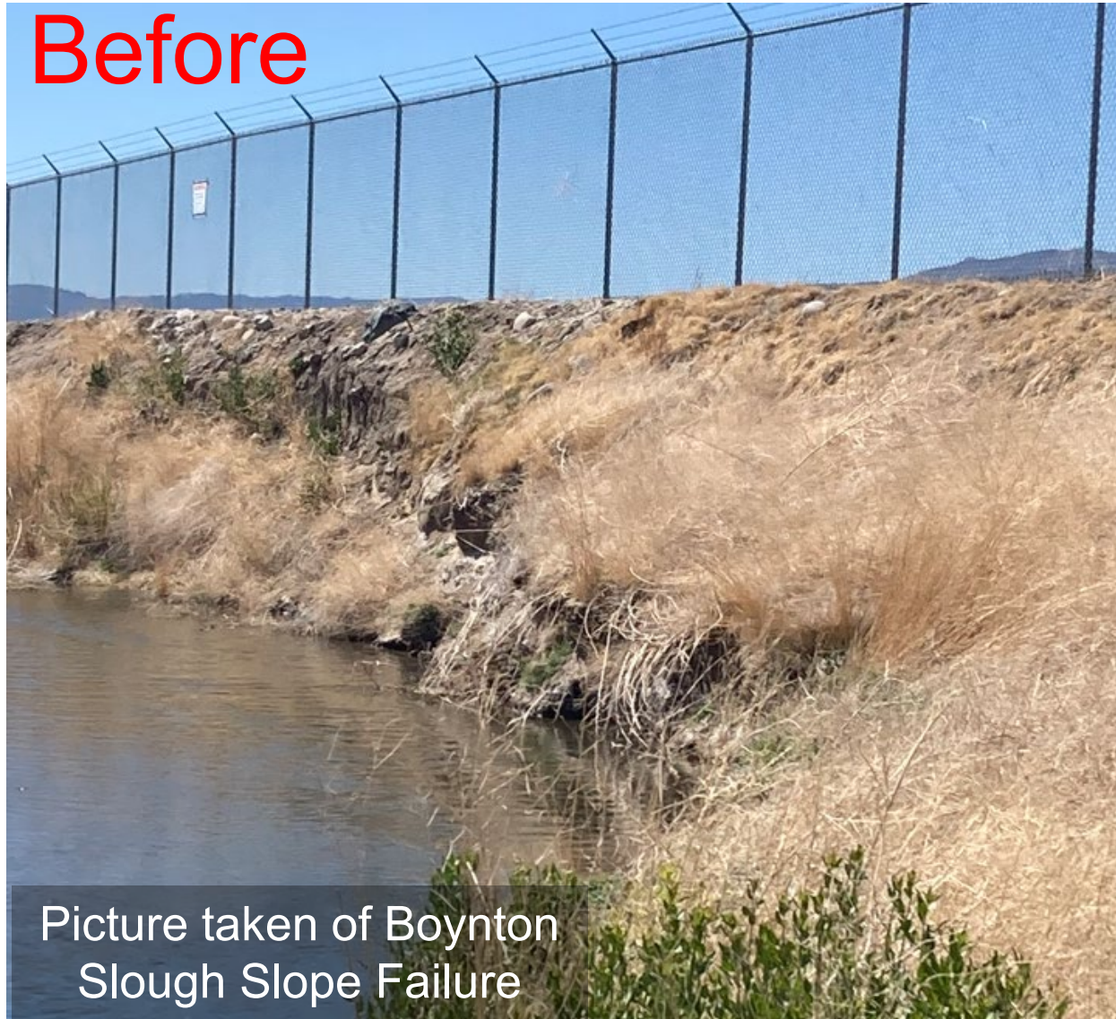
Picture taken of Boynton Slough Slope Failure