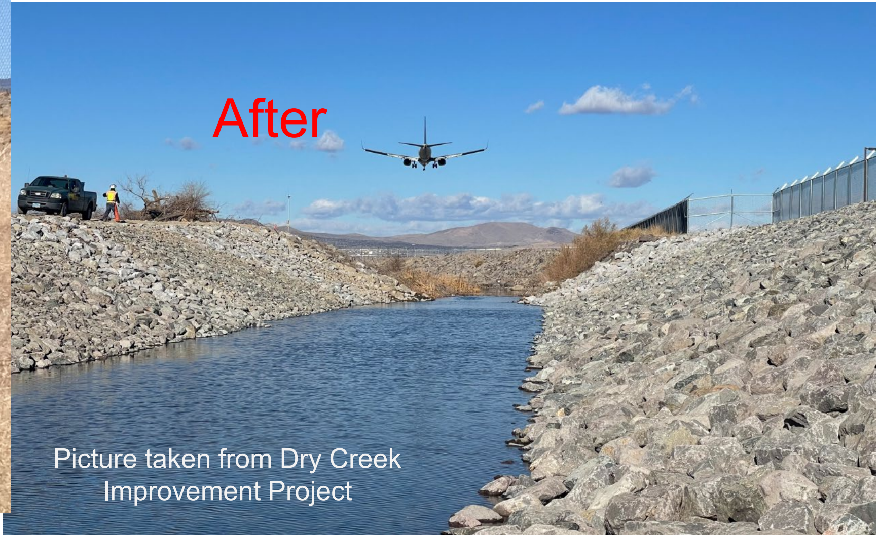
Picture taken from Dry Creek Improvement Project