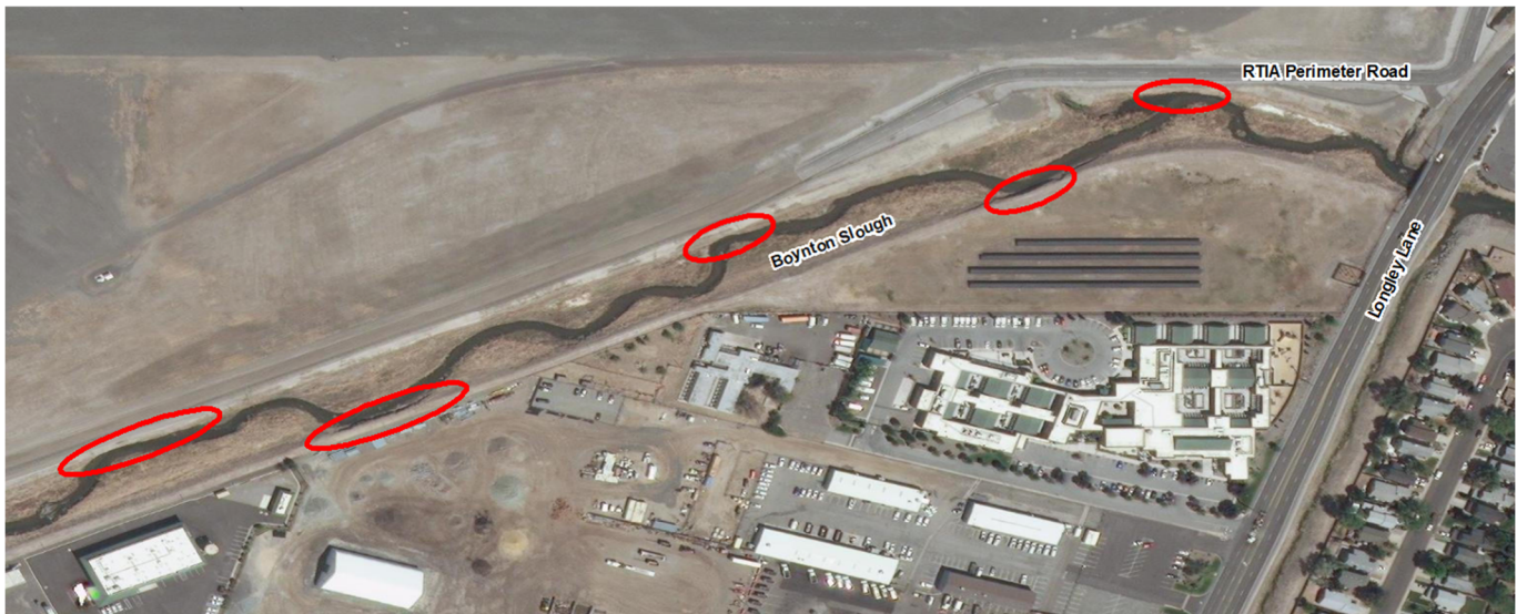
Figure 1 – Location Map

The following is a tentative construction schedule: