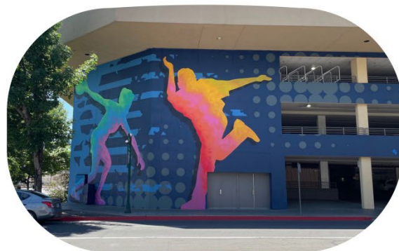
NATIONAL BOWLING STADIUM MURAL