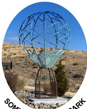
SOMERSETT WEST PARK