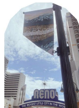
AERIAL GALLERY ARTIST BANNERS