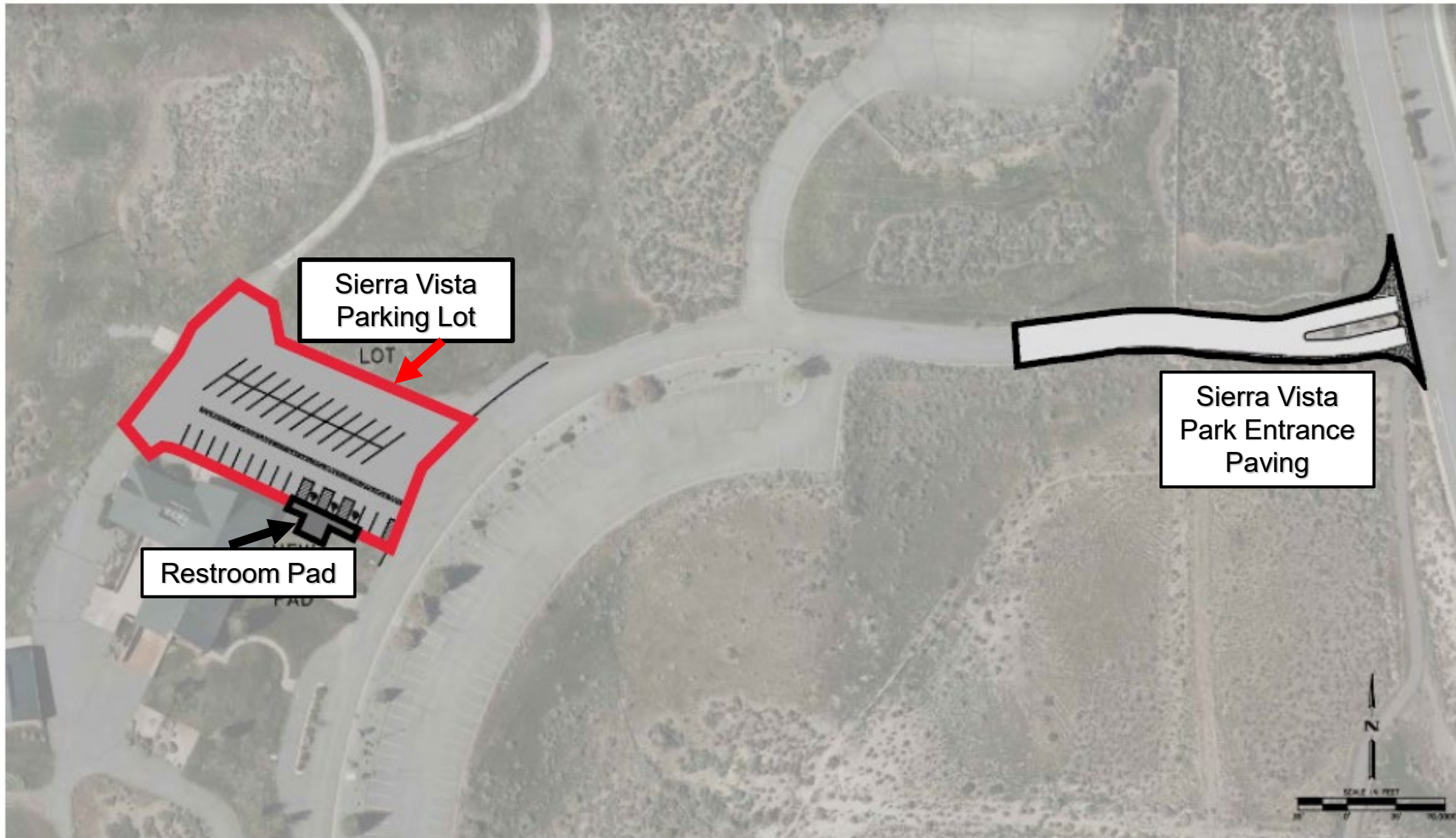
SIERRA VISTA PARK: 1985 BEAUMONT PARKWAY