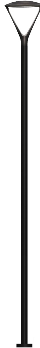
Option 2: modern shaped fixture