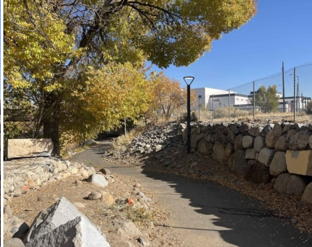
Option 2: modern shaped fixture