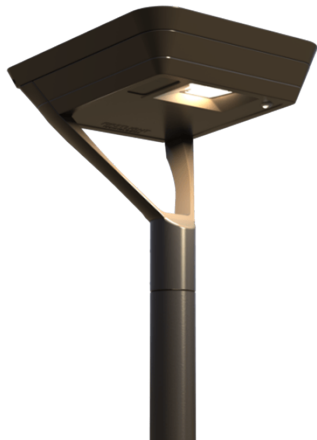
Figure 7. Proposed new solar powered LED light fixture

Staff competitively bid this project in October 2024. Three bids were received and opened on October 22, 2024. Titan Electrical Contracting, Inc. submitted the best bid pursuant to the requirements established in Nevada Revised Statutes (NRS) Chapter 338.147 and Code of Federal Regulations. Table 1 below shows the bid results.