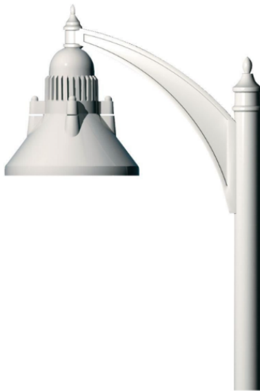
Figure 4. Option 1, bell shaped fixture fixture

Two light fixture styles are available to replace the current light assemblies at segments 1, 2 and 3. Light fixture option 1 is a bell shaped fixture in Figure 4 below on the left. Light fixture option 2 is the modern style fixture in Figure 5 below on the right. Either light assembly will be installed with a black finish, consistent with other fixtures around town, and is energy efficient LEDs that shine light downward to help improve the night sky environment while providing enough light coverage for the riverside walking path. Selection of one of the following two light assembly options was incorporated into the bid for this project. Council can select one light fixture style to replace the existing light assemblies at segments 1, 2 and 3.