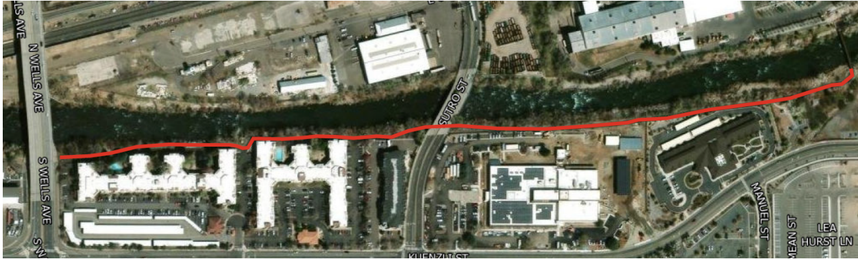
Figure 3. Segment 3 Truckee River Path Lighting

Two light fixture styles are available to replace the current light assemblies at segments 1, 2 and 3. Light fixture option 1 is a bell shaped fixture in Figure 4 below on the left. Light fixture option 2 is the modern style fixture in Figure 5 below on the right. Either light assembly will be installed with a black finish, consistent with other fixtures around town, and is energy efficient LEDs that shine light downward to help improve the night sky environment while providing enough light coverage for the riverside walking path. Selection of one of the following two light assembly options was incorporated into the bid for this project. Council can select one light fixture style to replace the existing light assemblies at segments 1, 2 and 3.