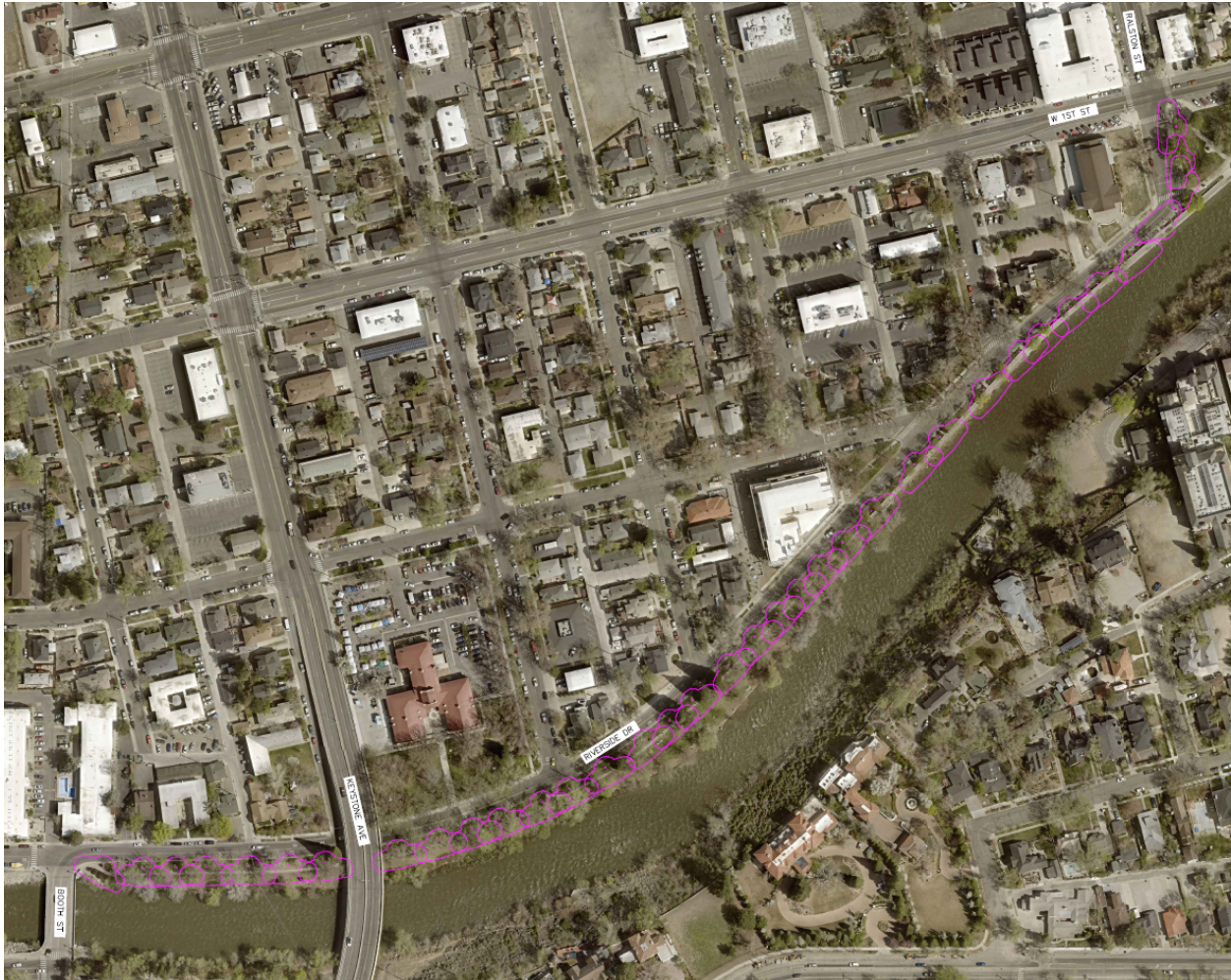
Figure 1. Segment 1 Truckee River Path Lighting