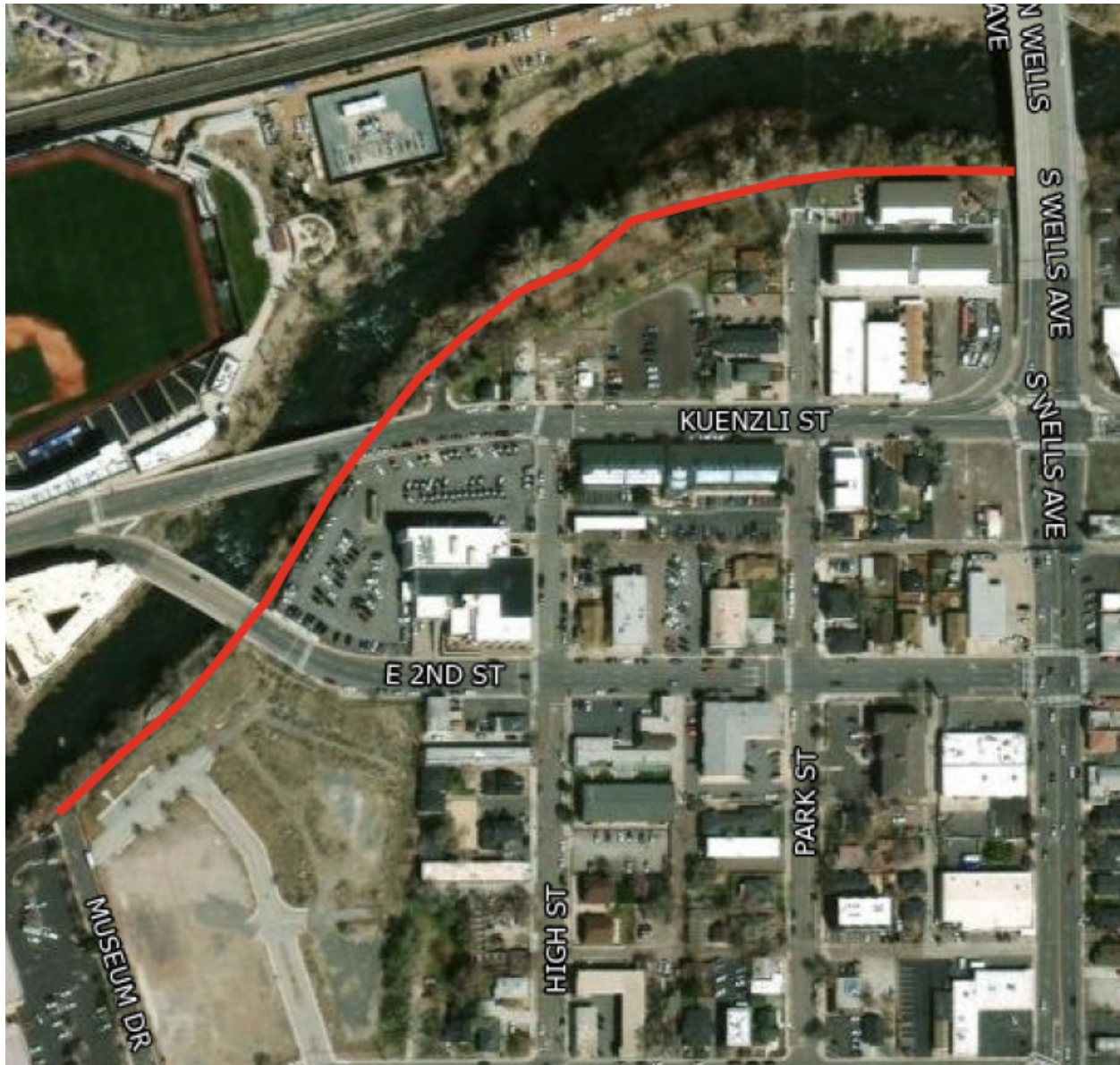
Figure 2. Segment 2 Truckee River Path Lighting