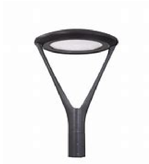
Figure 5. Option 2, modern shaped fixture