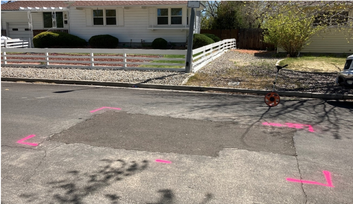
Typical Patch Before