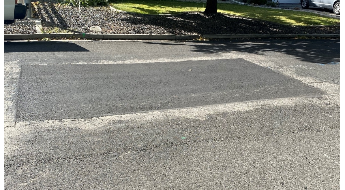
Typical Patch After