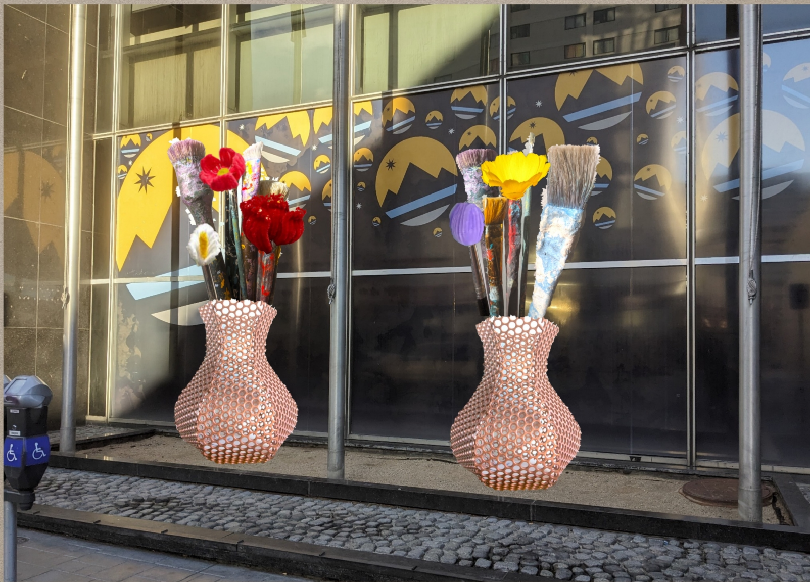
Virginia st location