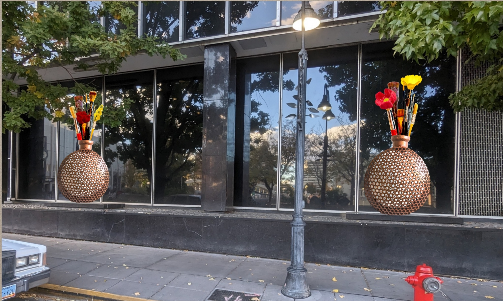
First St location