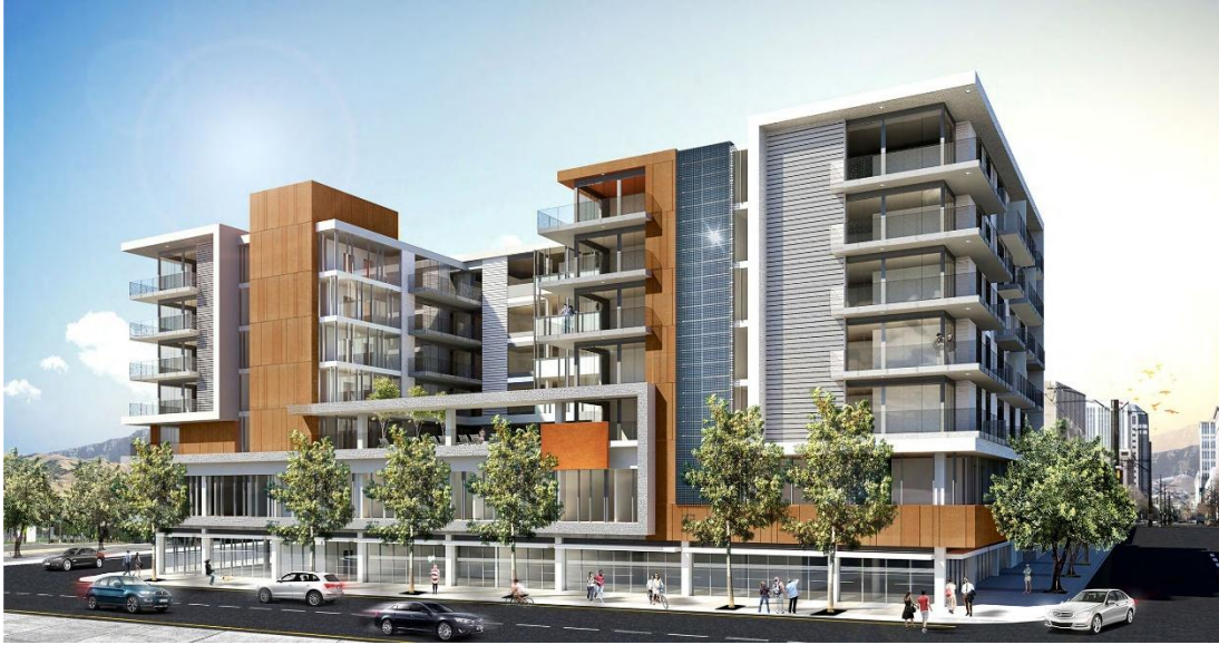
EXHIBIT 1 COMMENDABLE ARCHITECTURAL EXAMPLES