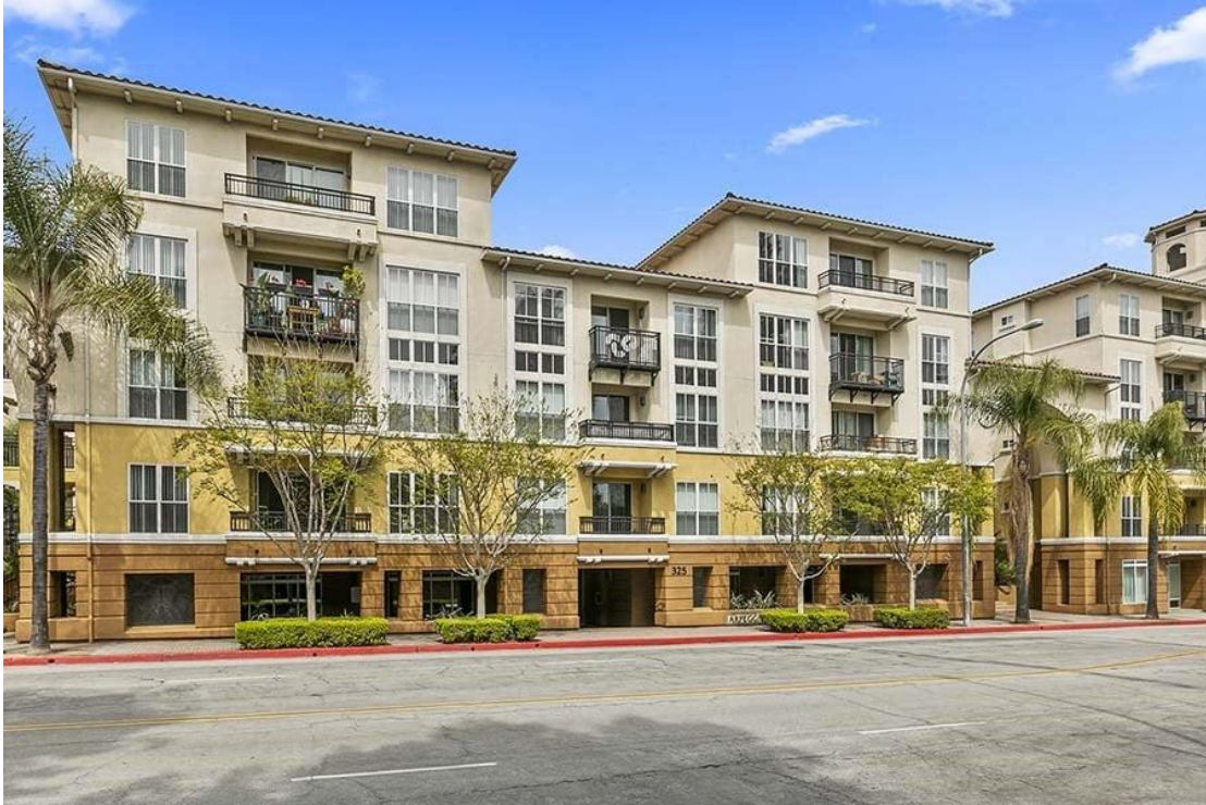
EXHIBIT 1 COMMENDABLE ARCHITECTURAL EXAMPLES