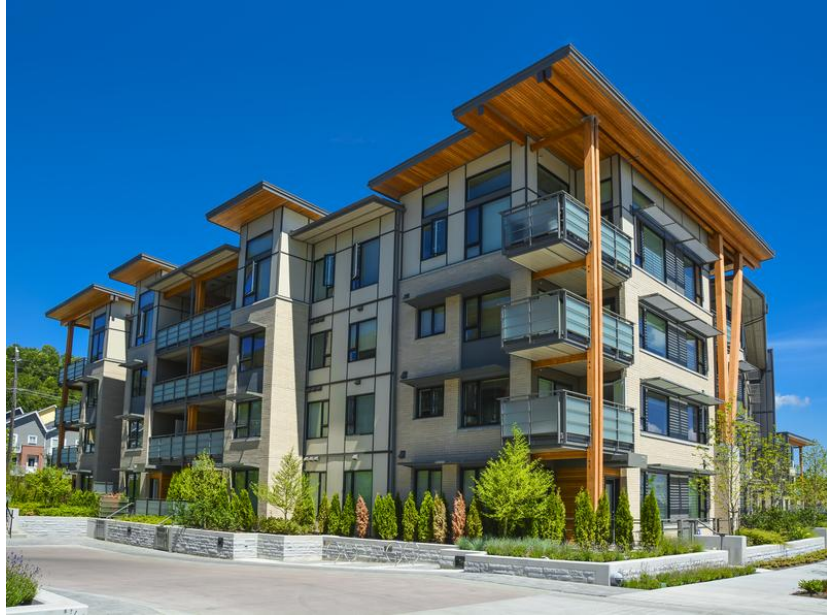
EXHIBIT 1 COMMENDABLE ARCHITECTURAL EXAMPLES