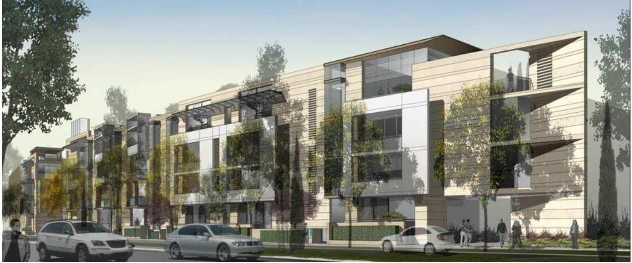
EXHIBIT 1 COMMENDABLE ARCHITECTURAL EXAMPLES