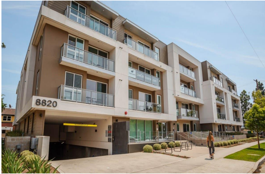
EXHIBIT 1 COMMENDABLE ARCHITECTURAL EXAMPLES