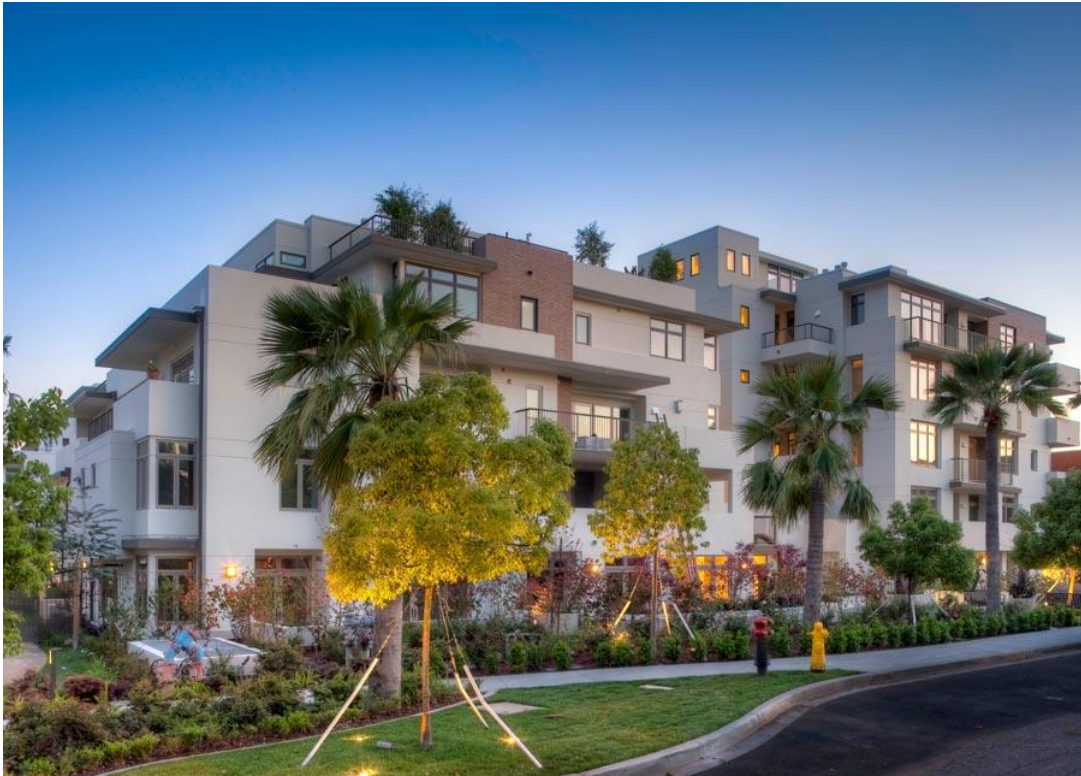
EXHIBIT 1 COMMENDABLE ARCHITECTURAL EXAMPLES