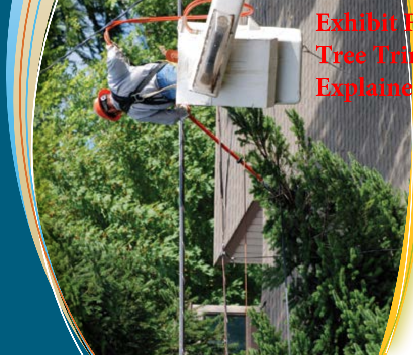
Exhibit F - NV Energy Tree Trimming Explained