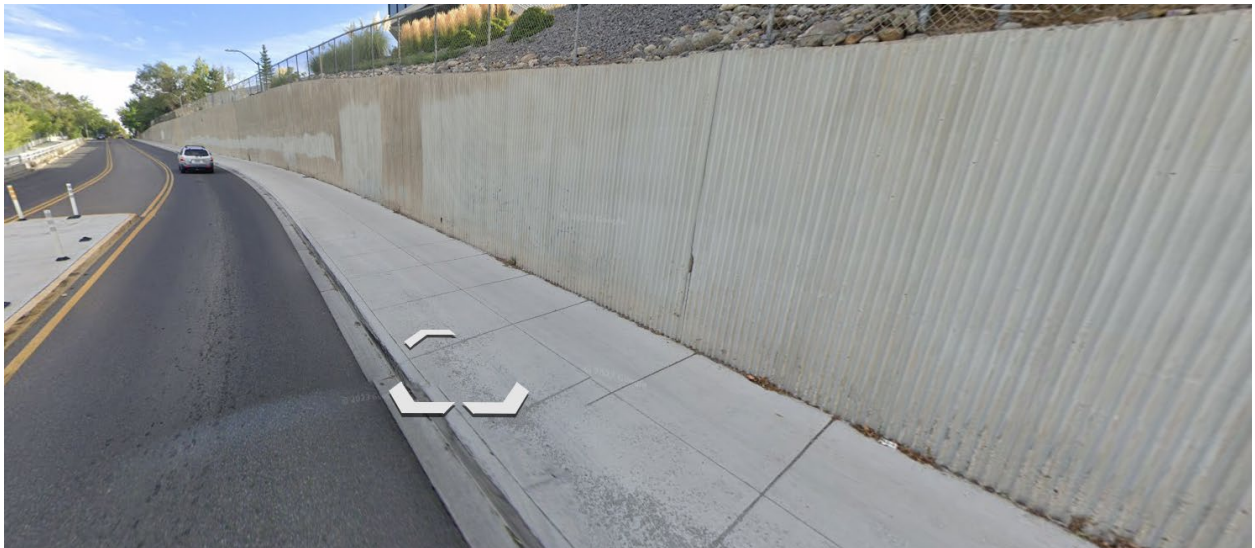
California Avenue Retaining Wall Facing East