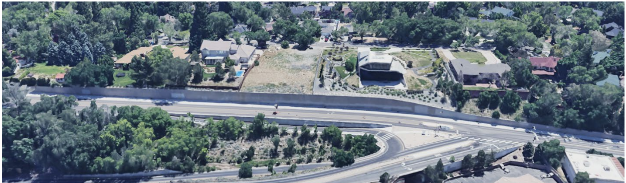
Aerial View of California Avenue at Keystone Avenue Intersection

Artwork will be installed on the exterior retaining wall along California Avenue between Booth Street eastward to the first residential driveway as shown in the images below: