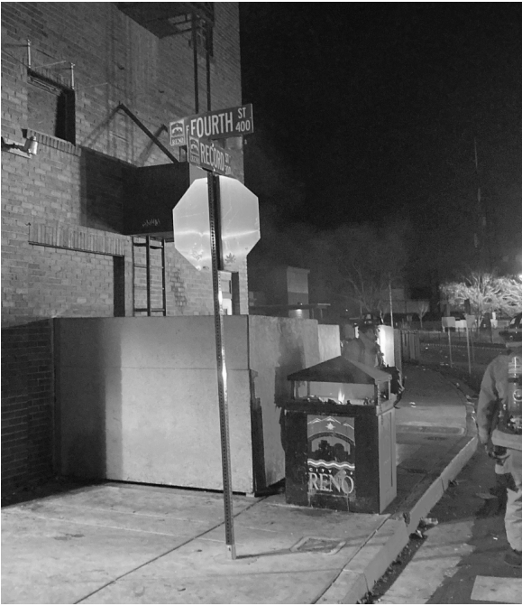
In August this trashcan was on fire overnight on Record Street outside of the Gospel Mission.