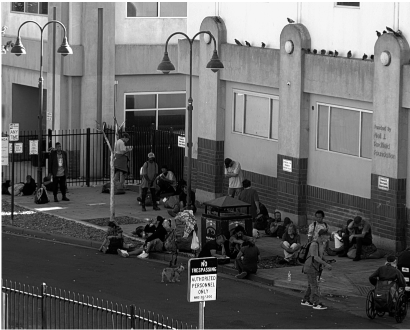
This one is leaning against a fence and electrical box. The trashcan was moved and has created an alcove that is often used as a restroom.