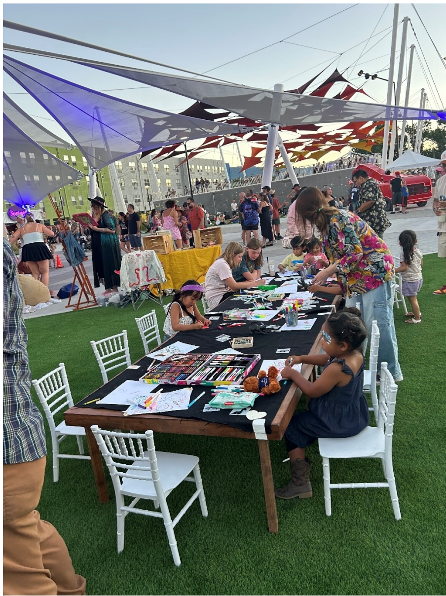
Reno Night Market