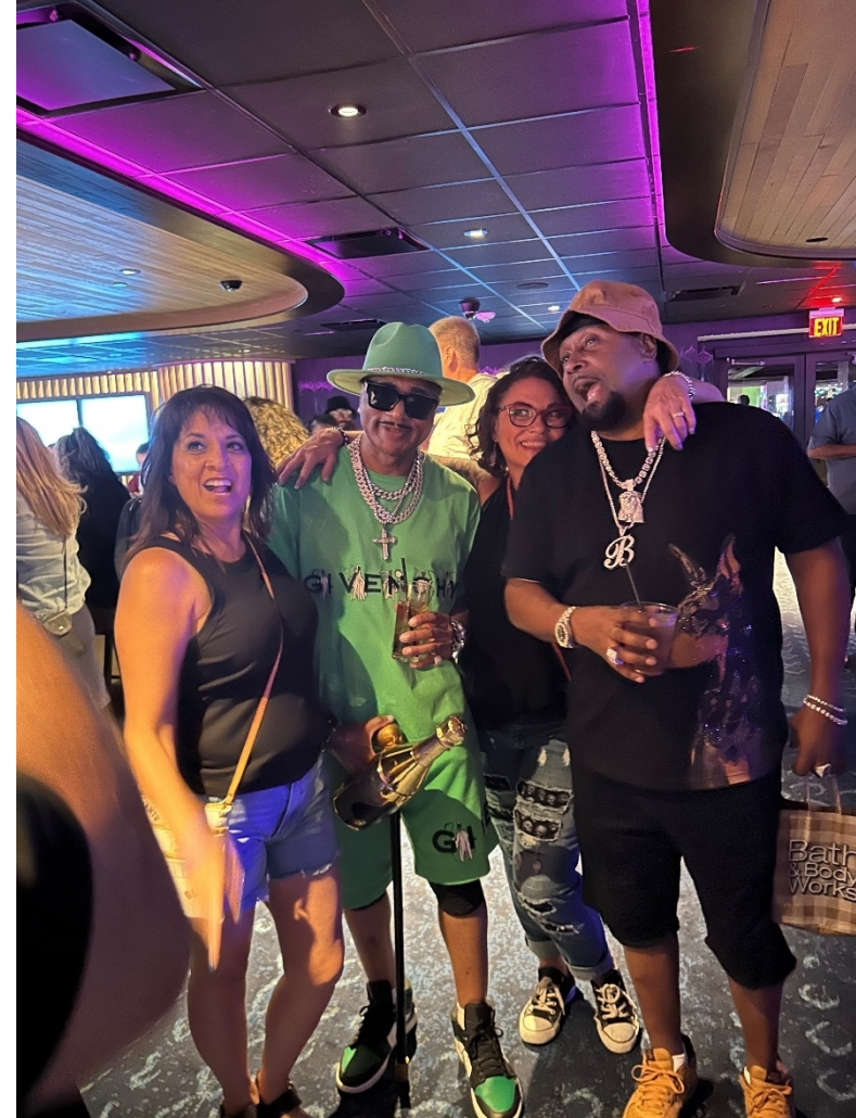
Bone Thugs-N-Harmony Concert