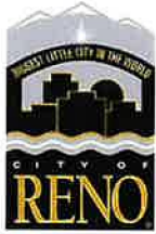
Exhibit A - Appeals

City Clerk's Office 1 E First Street 2nd Floor Reno, NV 89501 775-334-2030 CityClerk@reno.gov