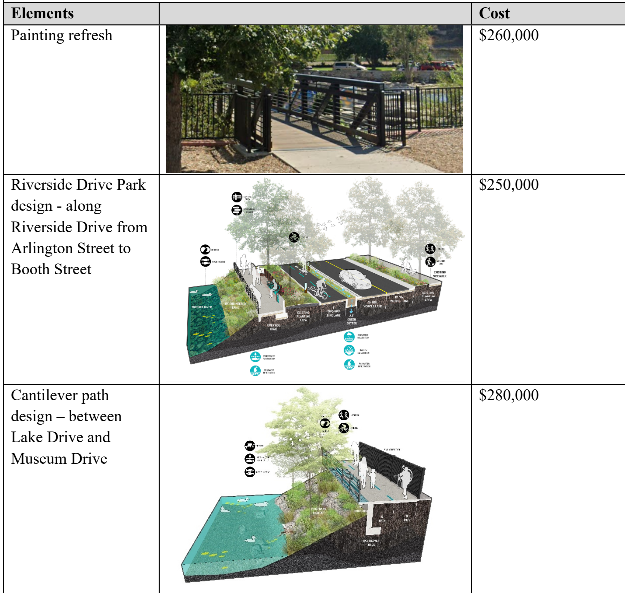
Table 1: Painting refresh, Riverside Drive Park design, cantilever path design, and lighting design, purchase, and installation