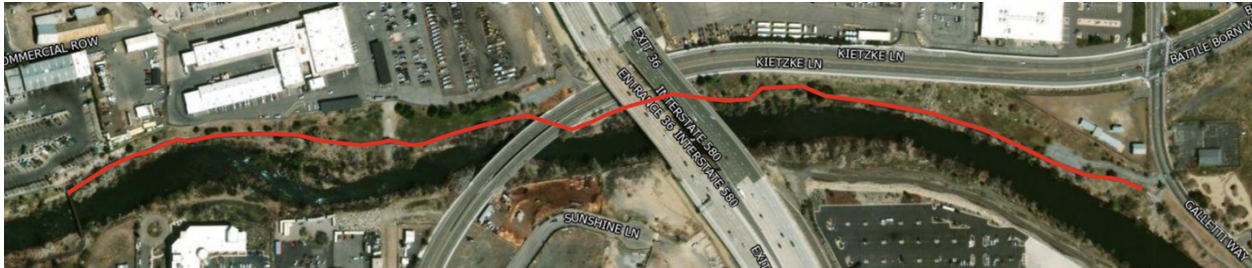
Figure 6. Segment 4 Truckee River Path Lighting

The fourth segment from the north side of the pedestrian bridge near John Champion Memorial Park to Fisherman's Park includes approximately twenty-six new solar powered LED light poles and fixtures. There is no functioning lighting in this segment. The electrical infrastructure can't be repaired like the other segments for traditional hard-wired lights. This same type of solar light assembly has already been incorporated into other pathway lighting in other areas of the City.