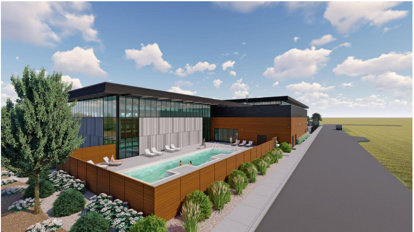
View of outdoor soaking pool, south-facing.