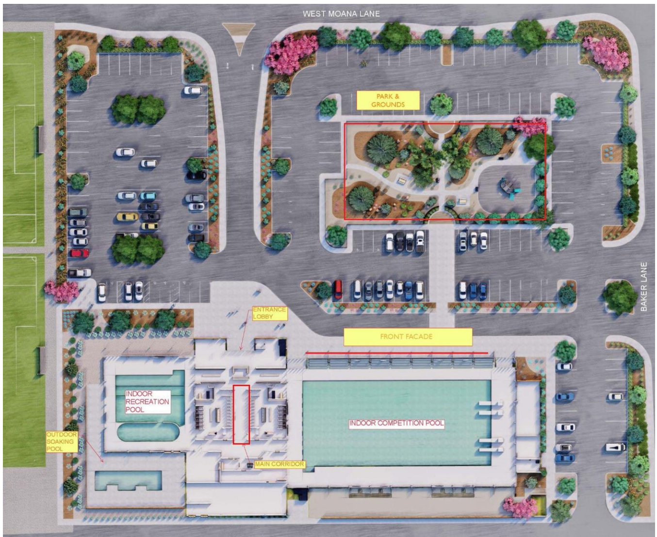
Overall site plan (yellow highlighted areas indicate priority areas for artwork).