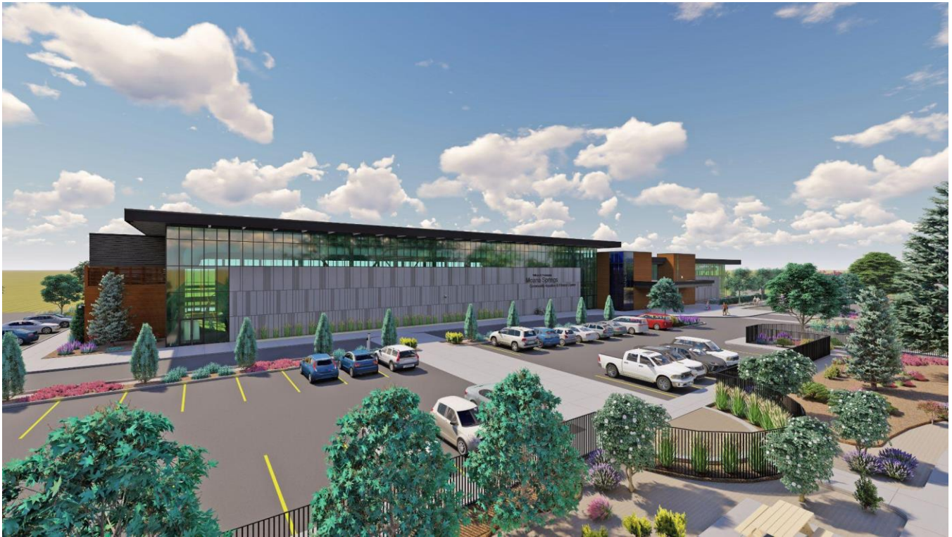
View of exterior north-facing facade.