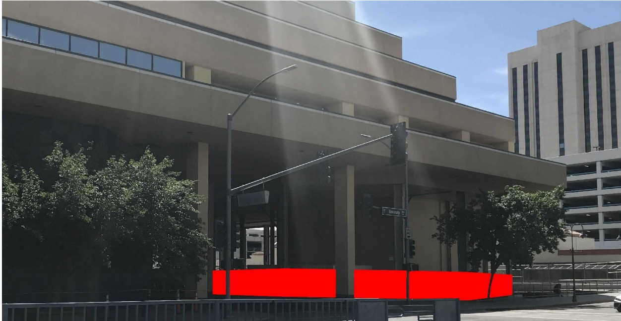
Figure 2. NBS new fence location (highlighted in red) under fourth floor.

The style of fence selected for this project is a non-scalable mesh to prevent trespassers from climbing the fence to gain entry to the open space under the NBS fourth floor. This style of fence matches existing fences nearby for a uniform look in the area. Figure 3 below, shows the style of fence that will be installed at the NBS at the adjacent ReTrac railroad trench near the Amtrak station.