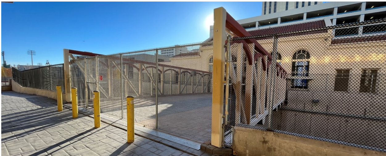
Figure 3. Existing non-scalable mesh fence along adjacent ReTrac railroad trench.

The style of fence selected for this project is a non-scalable mesh to prevent trespassers from climbing the fence to gain entry to the open space under the NBS fourth floor. This style of fence matches existing fences nearby for a uniform look in the area. Figure 3 below, shows the style of fence that will be installed at the NBS at the adjacent ReTrac railroad trench near the Amtrak station.