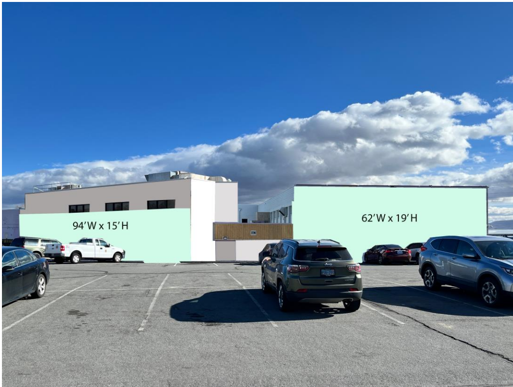
West side of Evelyn Mount Northeast Community Center