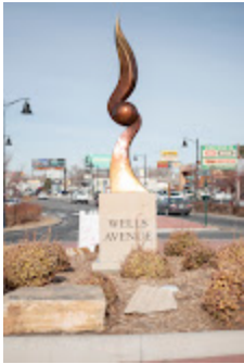
21-10-13 City of Reno Public Art Wells St Gateway sign.jpg 870K