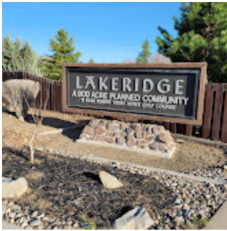
Lakeridge sign .jpg 2157K