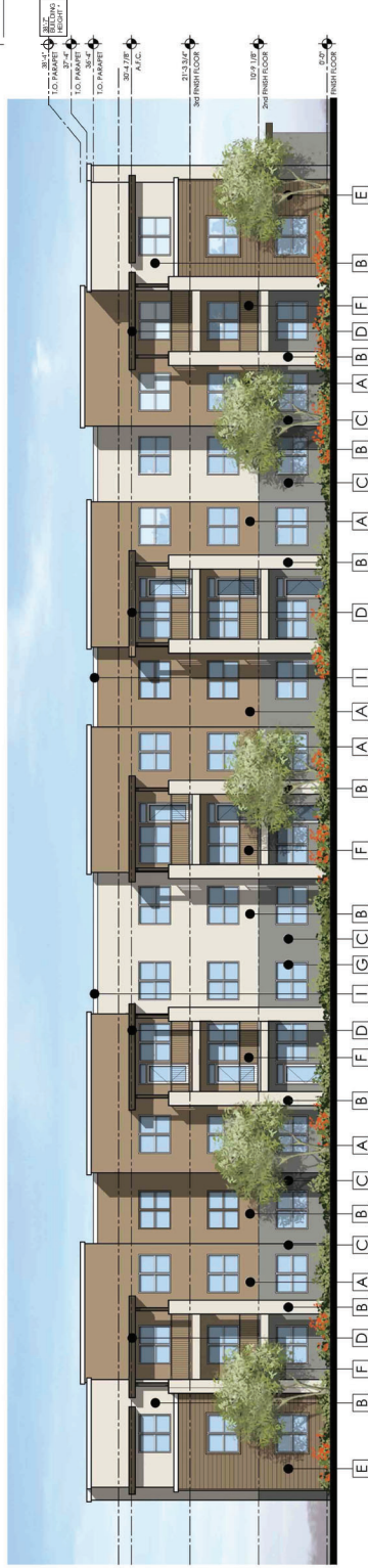
3 BACK ELEVATION