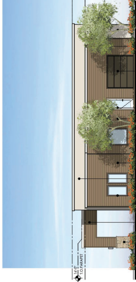
2 RIGHT SIDE ELEVATION