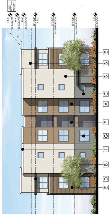
2 LEFT ELEVATION