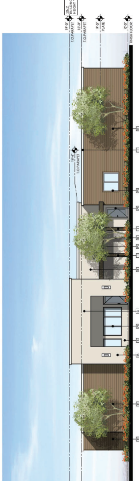
4 REAR ELEVATION