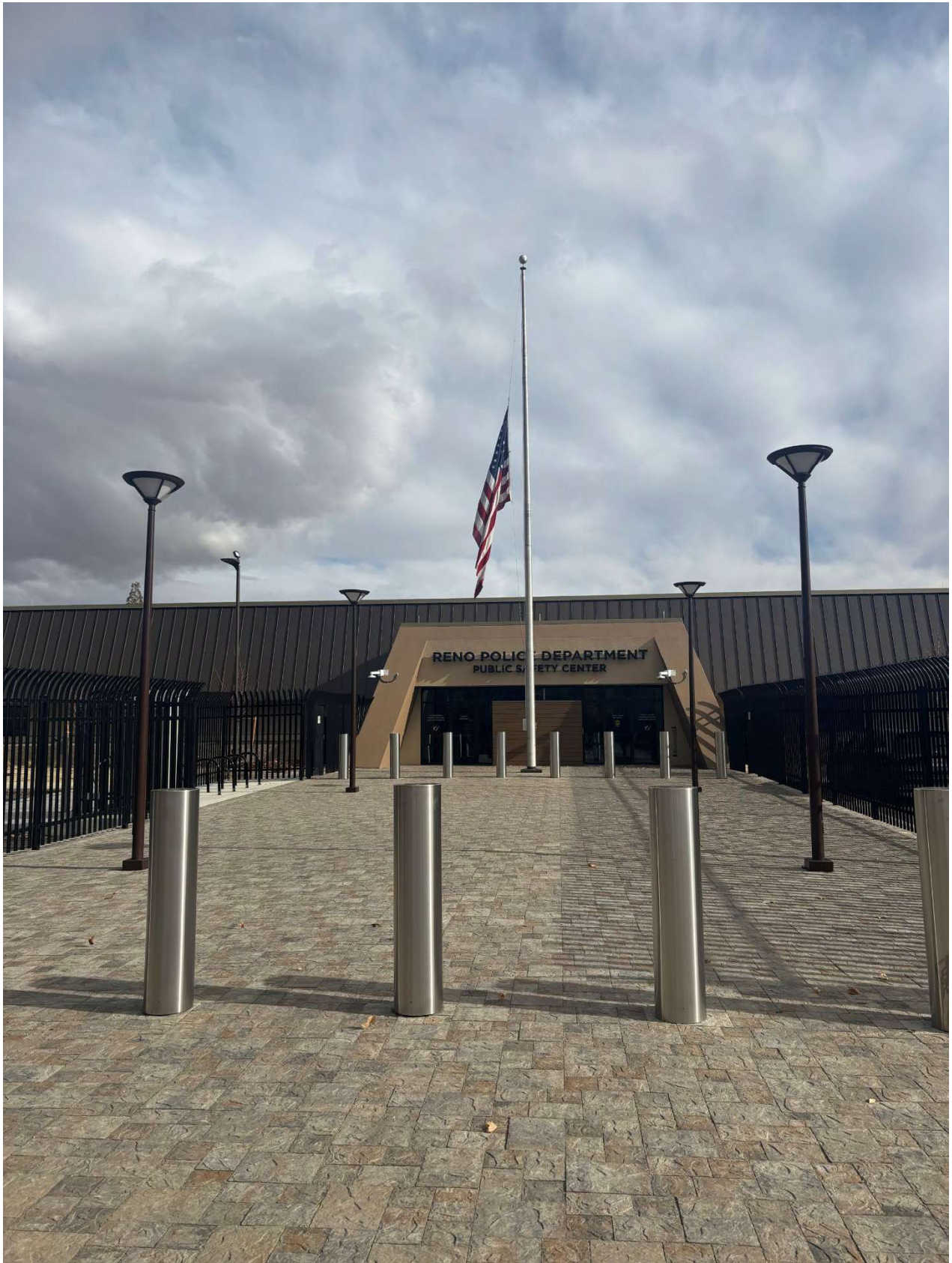
Image of Plaza facing East