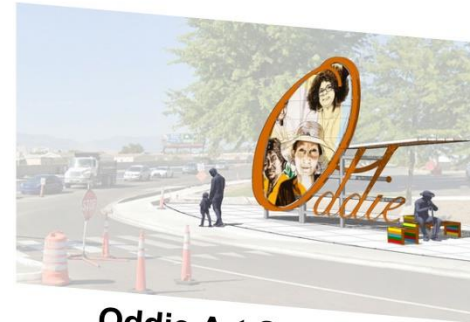
Oddie Art Selection