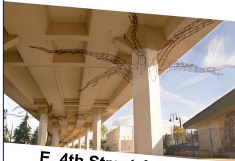
E. 4th Street Artwork