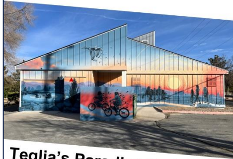
Teglia's Paradise Park Mural