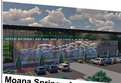
Moana Springs Art Selection