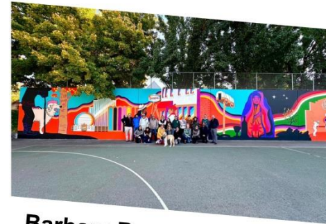
Barbara Bennett Park Mural