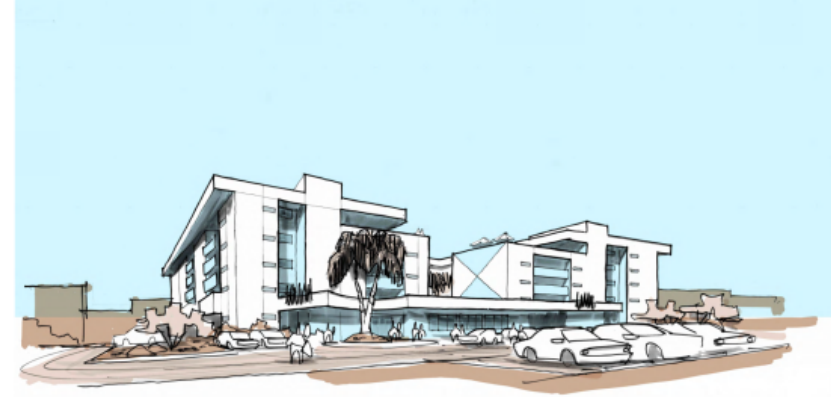
ULYSSES - 315 RECORD STREET RENO, NEVADA RFP PACKAGE - ARCHITECTURAL CONCEPT SKETCH | KAR 224064 | DATE 07/19/2024