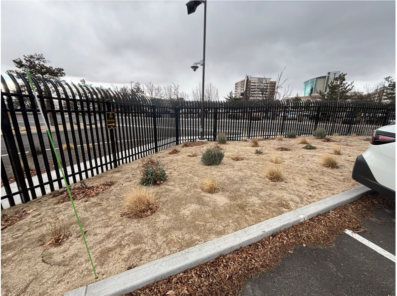
Image location of the sculpture facing south.