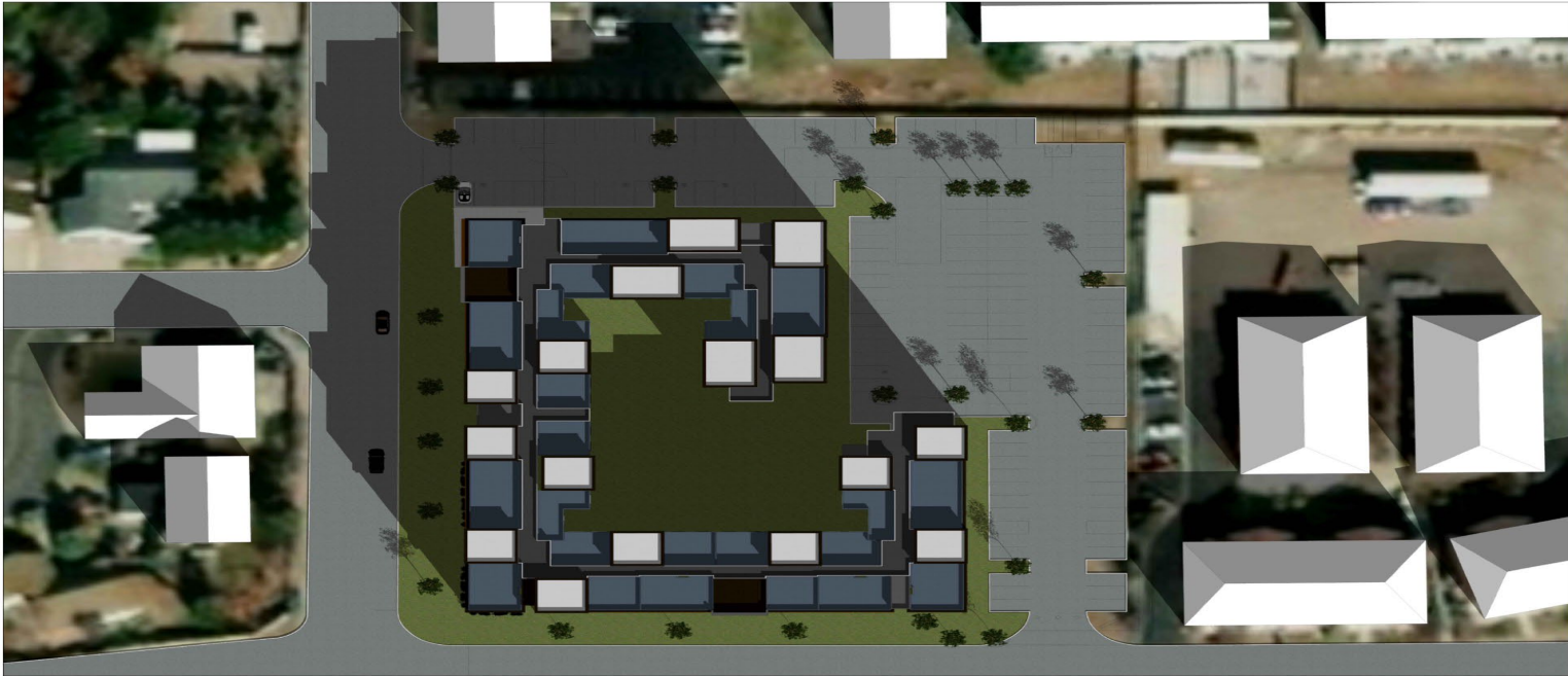
WINTER SOLSTICE 12/21/2022 @ 10:00AM SHADOW STUDY (REFERENCE ONLY) SCALE: 1/8" = 1'-0" 1