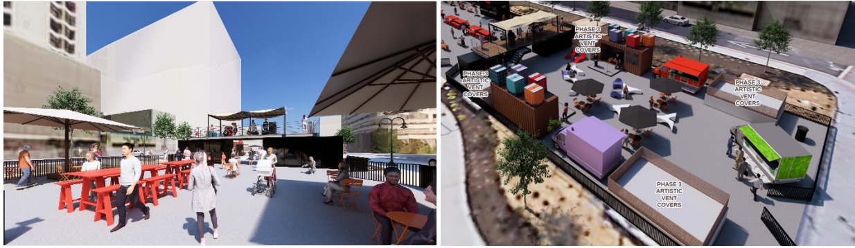
Table 3: Locomotion Plaza Stage 1 – Activation and Maintenance Pilot (SLFRF)