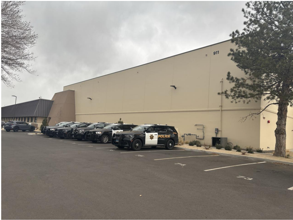
Image of south-facing wall.