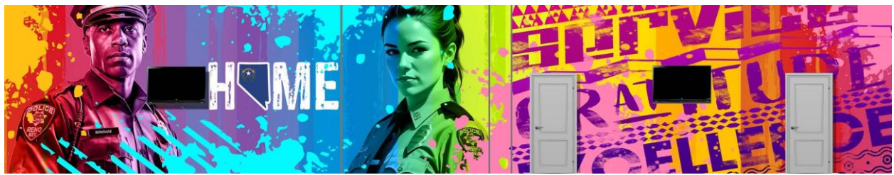
Preliminary proposal of artwork for by Rafael Blanco to be further refined from input from stakeholders.