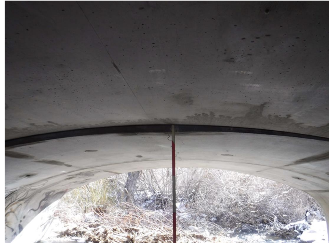
Sag in the top of Arch Segment No. 8