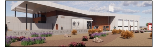
Henderson FS 92