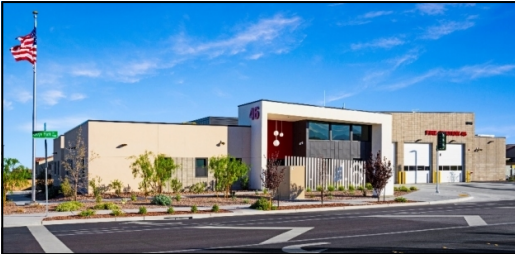
Skye Canyon FS 46