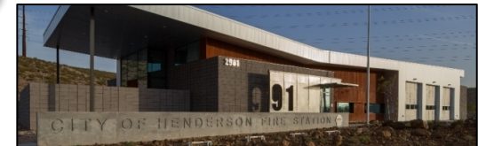
Henderson FS 91