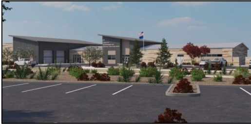
Carson City FS 55