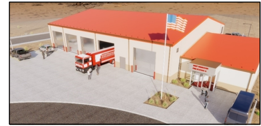
West Wendover FS 4