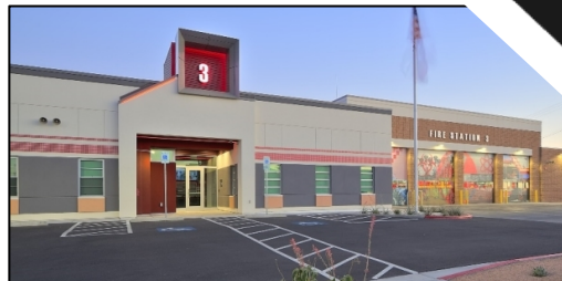
Las Vegas FS 3