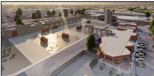
Las Vegas Fire Training Center