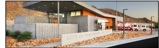
Henderson FS 85