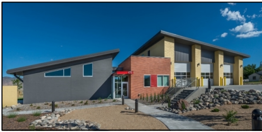
Truckee Meadows FS 33