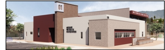
Mesquite FS 1